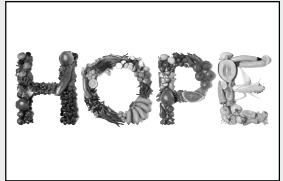
Actual Card Size: 7" x 5" in full color

Recipients receive a color version of this striking card and a gift tag of your choice. Below are examples of gift tags we enclose in your cards. To order, fill out the form on the back and mail it to us. Holiday Gift Card orders can be completed online at www.rffb.org or over the phone by calling 505•349•8921. The last day to order online is Dec. 19 th , but phone orders or walk-in orders in Albuquerque are available until Dec. 23 rd at noon. Cards ordered online will be sent directly to the buyer to mail to recipients.